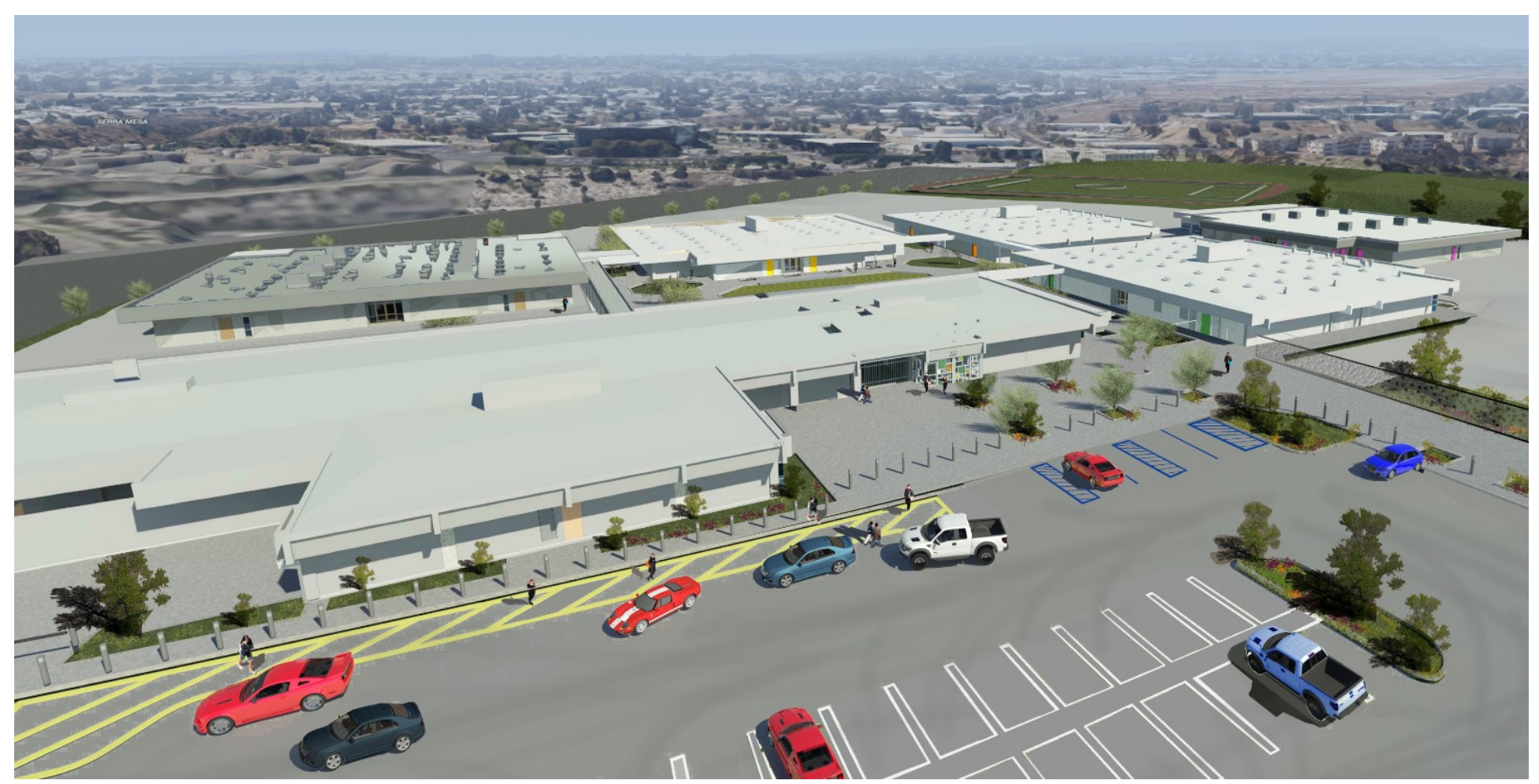
Rendering of completed Whole Site Modernization Project